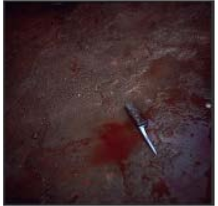
Miguel Rio Branco Apunhalada , 1993/2020 Cibachrome 80 x 160 cm