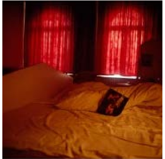
Miguel Rio Branco FRANCE. Languedoc-Roussillon region. Town of Nimes / Berlin Hotel Room , 1994/2020 Cibachrome 80 x 160 cm