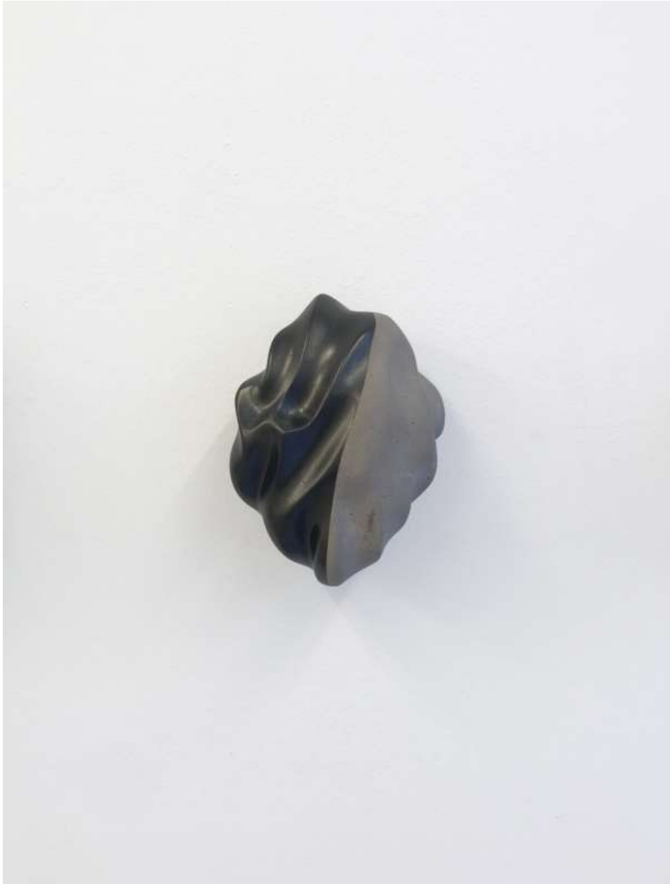
Matter (disposition) Diogo Pimentão Concrete and graphite Variable dimensions 2019