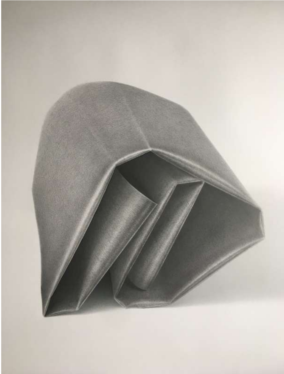
Construct (Entity) Diogo Pimentão Inkjet print and graphite 69.5 x 54.7 cm 2019